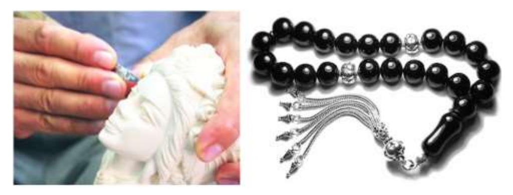
Figure 5. Sepiolite (Eskişehir) and Oltu Stone (Erzurum)