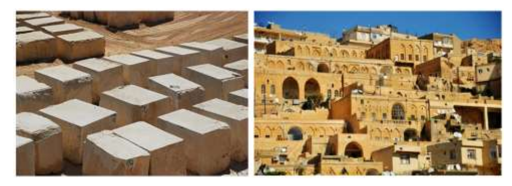
Figure 4. Mardin Stone and Historic Mardin Houses

11.2.18. The activities included with the acquisition "Assesses effective use of mining and energy sources in Turkey in terms of their contribution to economy" may include the information that Afyon Marble, Denizli Travertine, Eskişehir Sepiolite, Oltu Stone and Mardin Stone have geographical indication and students may be asked to write compositions regarding the effects of these products on local and country economy. Also, students may be asked to utilize geographical questioning skills to do research on the other resources that can generate similar values (Figure 4, 5).