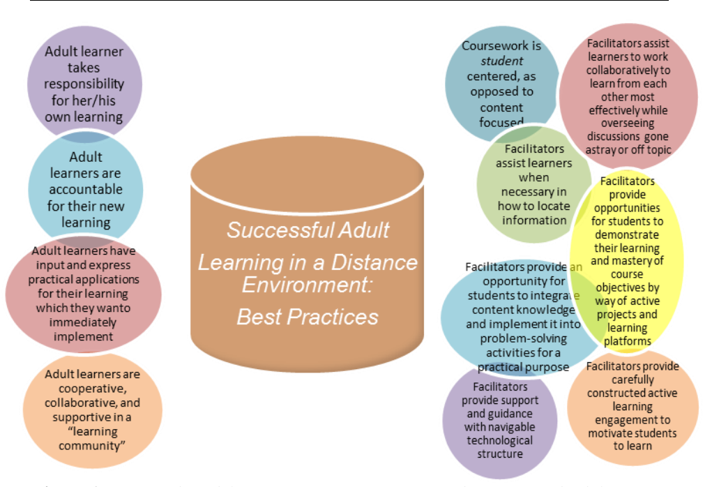
Figure 1. Proposed Model for Learning Success in a Student-Centered Adult Distance Learning Environment