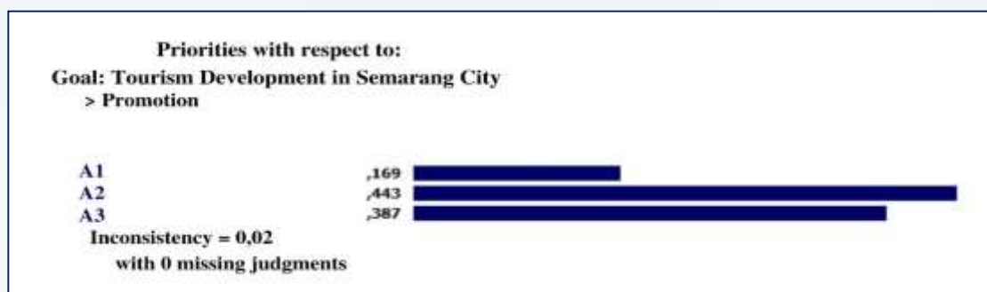
Figure 3. Result of Analysis of Alternatives in Promotion Criteria

Based on AHP analysis of alternatives in promotion criteria, the result can be seen as follows: