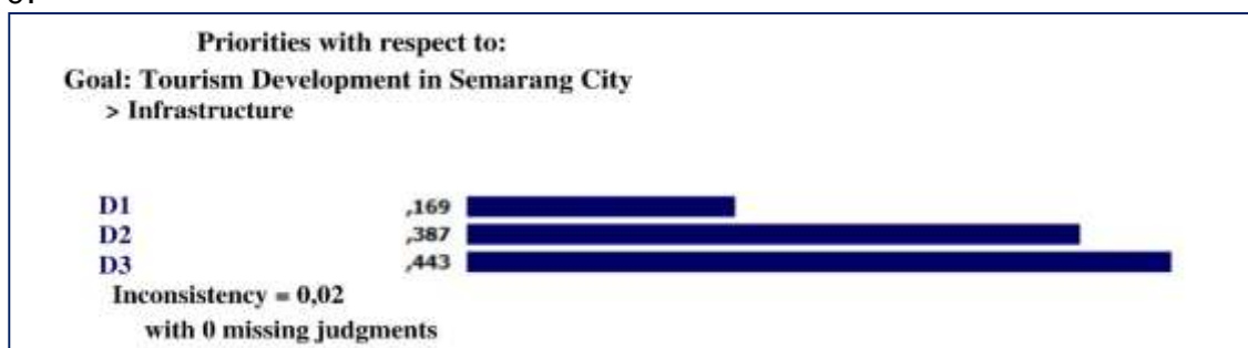
Figure 6. Result of Analysis of Alternatives in Infrastructure Criteria

Based on AHP analysis to the alternative in infrastructure criteria, the result can be seen in figure 6: