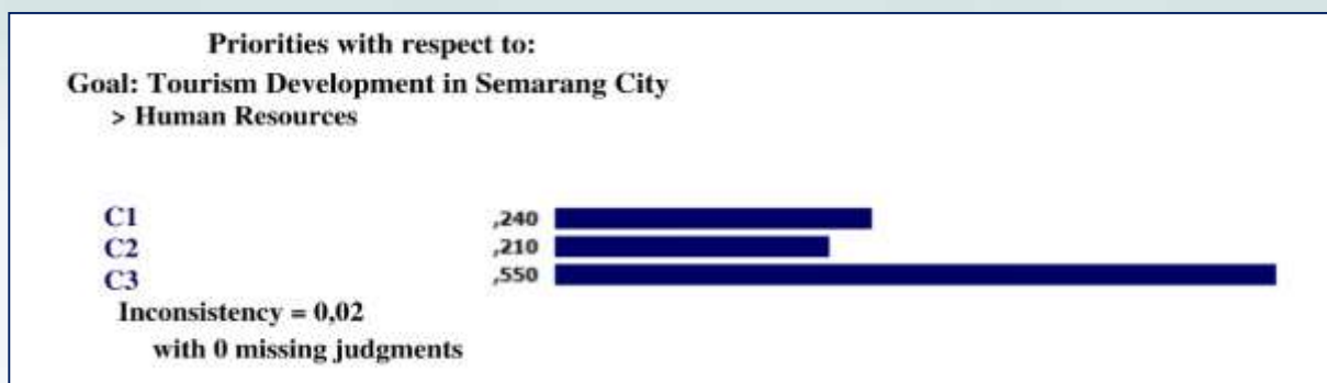
Figure 5. Result of Analysis of Alternatives in Human Resource Criteria