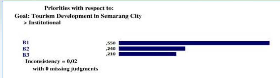
Figure 4. Result of Analysis of Alternatives in Institutional Criteria