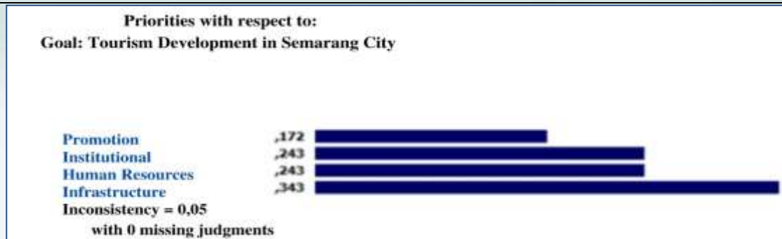
Figure 2. Analysis Result of Criteria in City Branding Implementation to Develop Tourism in Semarang City