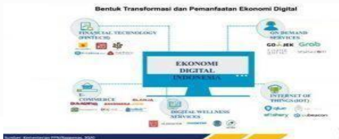
Figure 1 – Digital Economy Indonesia