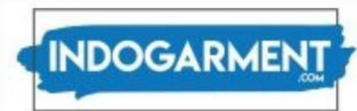
Figure 3 – Indogarment Logo

Mission: Implement good management system in the management of the company. Produce high-quality products and always do innovation to meet consumer needs. Creating a good and conducive of working environment. Creating a mutually beneficial relationship with all stakeholder.