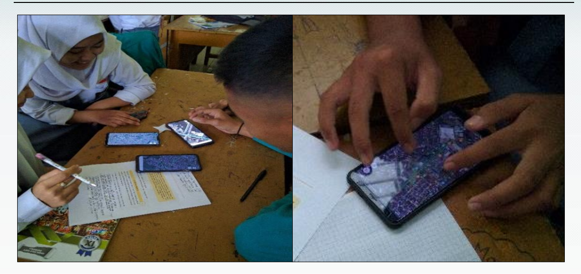
Figure 1. Students discussion method by using google earth in urban schools

Experiment learning activities in the school on the character of the rural environment.