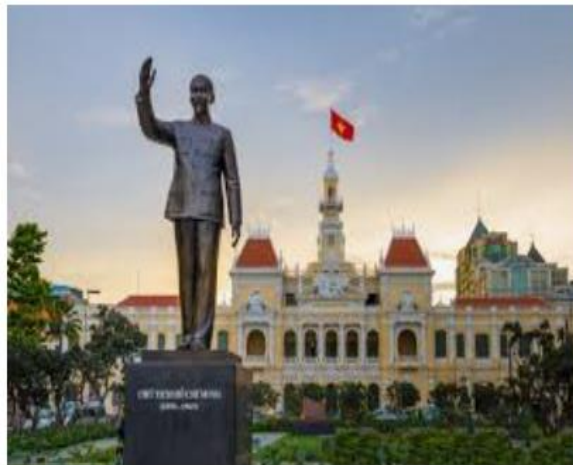
Figure 2 - Ho Chi Minh - a great leader