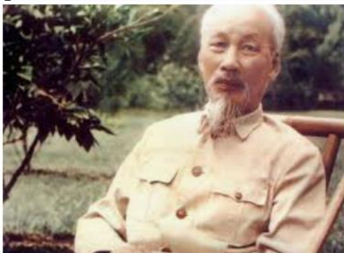
Figure 3 - Ho Chi Minh the talented leader