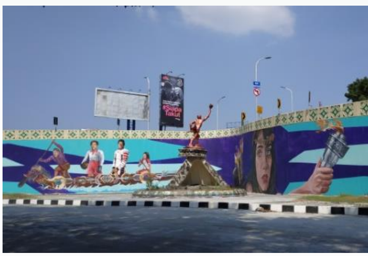
Figure 1. The war of murals and branded OAs on three different locations: Manahan flyover (mural-1 & branded OA-1), Slamet Riyadi-Gatot Soebroto intersection (mural-2 & branded OA-2), and Manahan stadium (mural-3 & branded OA-3).