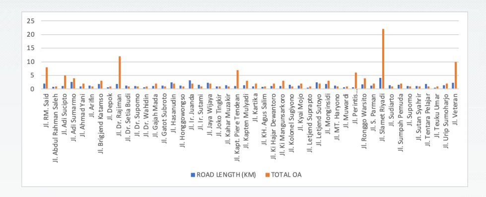
Figure 2. The length of roads and the number of OA in Surakarta (source: Authors' analysis)

to city walls and street furniture. The official number of OA is compared with the length of the road section and the density mapping can be checked in figures 2 and 3.