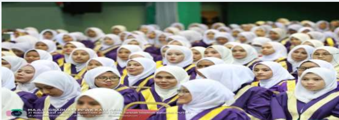
Figure 3. 14th PPWK Graduation Ceremony